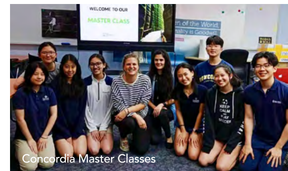
Concordia Master Classes

Yena K. HS Student Reducing Food Waste Master Class