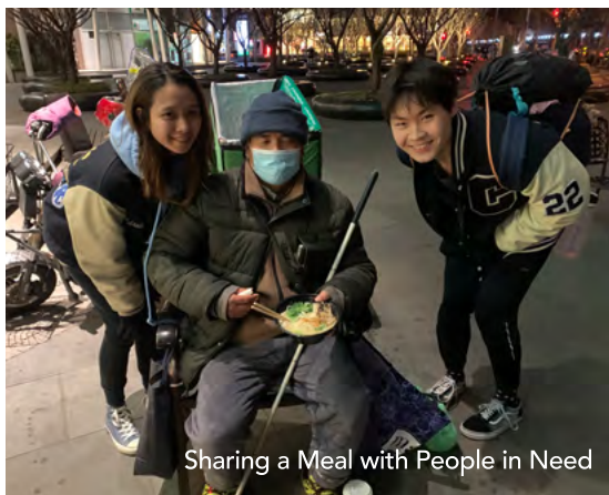
Sharing a Meal with People in Need

The Bokashi Bin Restart has been devised by a student group who plan to address food waste issues on our campus. This composting initiative will allow Concordia to become more sustainable as well as inspire a more sustainable mindset towards our usage of resources. Fertilizer from the composted material will be donated to Tongchu Organic Farm, which will grow loofah with the composted fertilizer that they will then distribute to the Concordia community.