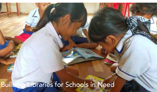
Building Libraries for Schools in Need

A number of middle school students have been successfully competing in online math competitions throughout the school year. Having advanced through the necessary rounds, our MS Math teams will now have the opportunity to compete in person at a special math competition to be held here in Shanghai.