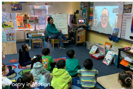
Poetry in Motion